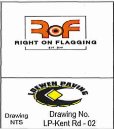
Figure # 7.8 in the TCMWR 2015 Edition Single Lane Alternating This Traffic Control Plan is designed to accommodate patch work on Kent Rd. There are three patches in close proximity Work to commence Wednesday, Aug. 8th, 2018 and is expected to be completed in one day, however permit will be requested for a week Work hours shall be from 7:00 am - 5:00 pm All signs and traffic devices shall be placed in compliance with WCB and the TCMWR